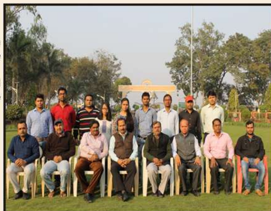
Staff & Ph.D. Students